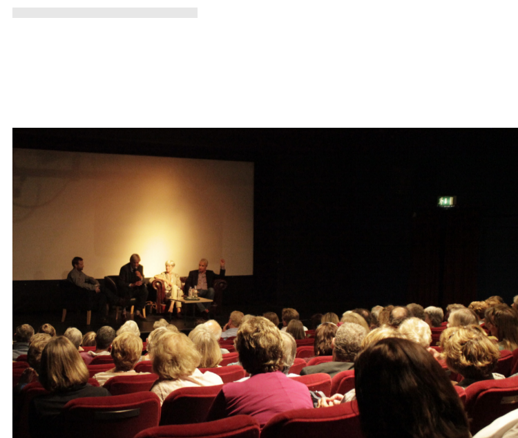
Theatre & Arts