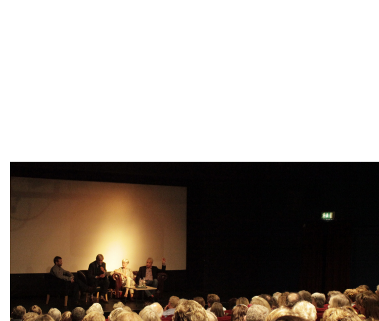
Cinemas & Cross-Arts Venues

Further content Linked images (black and white rollover)