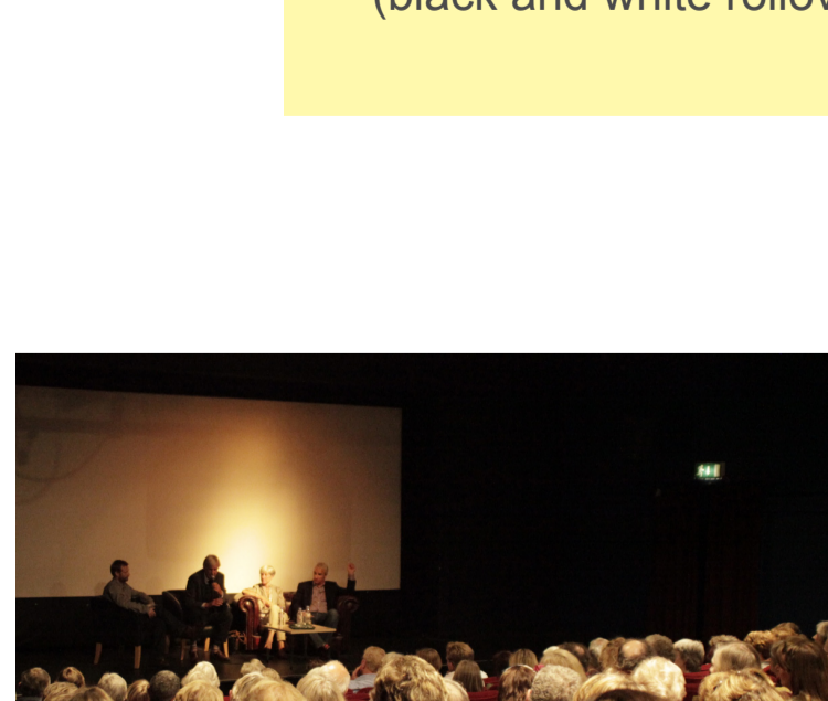
Film & Media