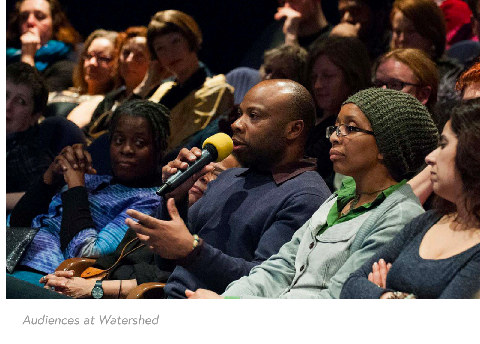
Audiences at Watershed

Intro - H1 text - 2 column, image on left - Citation text under image