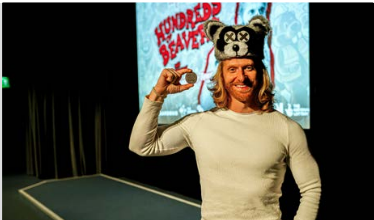
Slapstick Film Festival: Hundreds of Beavers screening

The BFI Film Audience Network (FAN) reaches out across the UK to ensure people have opportunities to watch and enjoy a diverse range of films and moving image, regardless of geography or circumstance.